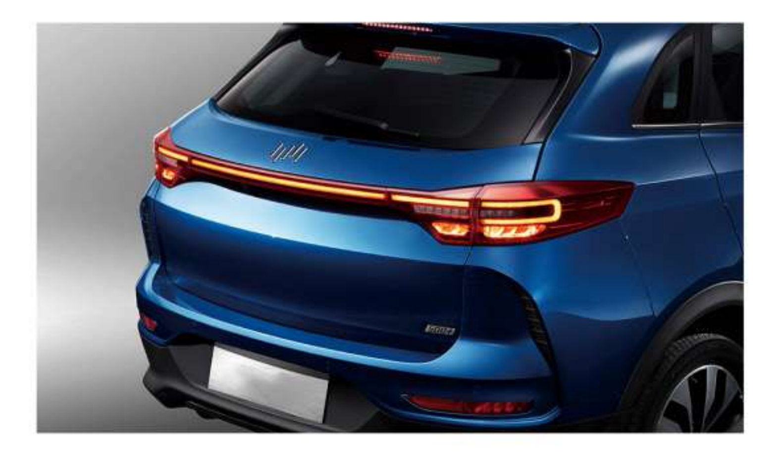
Integrated Tailights | Sport Tail Design

Daytime Running Lights Smart Led Headlights